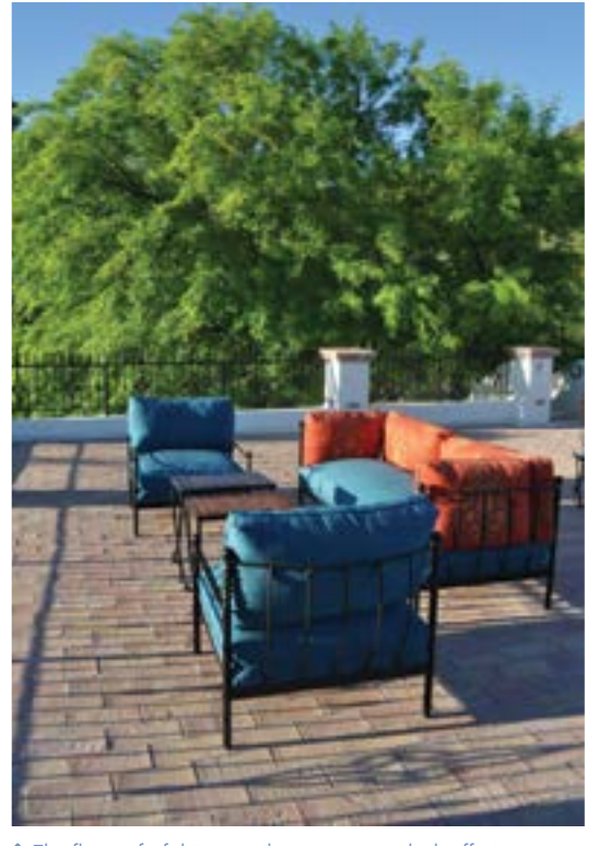
↑ The flat roof of this ramada serves as a deck offering sweeping views of the mountains and Arizona sunsets. It also incorporates a fire pit to ease the chill on cool winter nights. (Design and photography courtesy Exteriors By Chad Robert, Inc.)