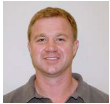
↑ "Homeowners who put substantial investment into their backyard want the option to comfortably sit outside and enjoy their space," says Zach Fluto owner of Premium Decks.