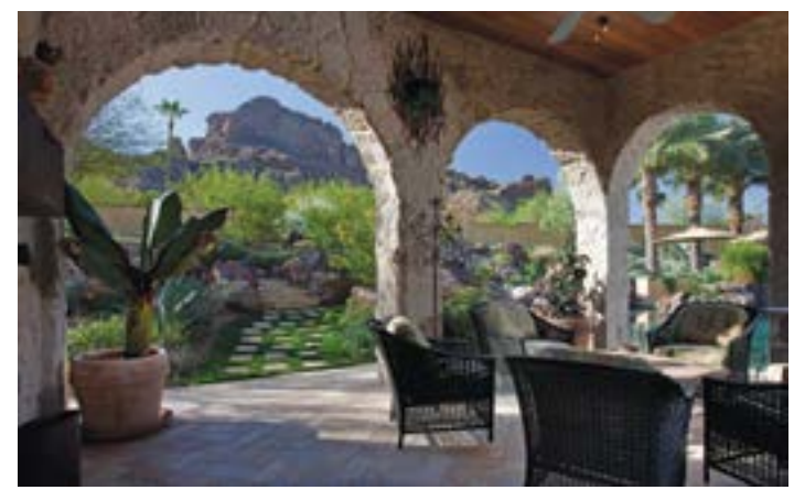
← Proper location of a structure in the garden will ensure its continued use. This ramada perfectly frames mountain views and is connected to both the pool and the hummingbird garden. (Design and photography courtesy Exteriors By Chad Robert, Inc.)

When using a pergola or ramada within your outside space, it's important to decide on the main purpose for its use. "Homeowners should consider whether they are looking at adding a pergola for shade, looks or both. If your location is in direct sunlight, you'll probably prefer something that provides more shade," states Todd Funfar, president of Deckmasters in Fargo. "Material is an important factor as well. Cedar is less expensive, but there is more maintenance involved. Painting or staining the wood can be tedious. Low-